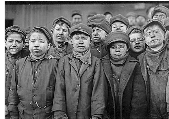
Poor children in 1840s England

The Industrial Revolution took place during the late eighteenth and early nineteenth centuries. This was a time when a mainly agrarian society was transformed by new technology. The increased output per worker made possible by the new technologies moved much of the agricultural workforce from the countryside into large urban centers of production. The consequent overcrowding into areas with little supporting infrastructure led to many problems. Since there was limited opportunity for education, many poor children were expected to work to help their families. Dickens witnessed many of the appalling conditions that child workers faced. He planned to publish a political pamphlet describing what he saw, but changed his mind. The pamphlet later became A Christmas Carol .