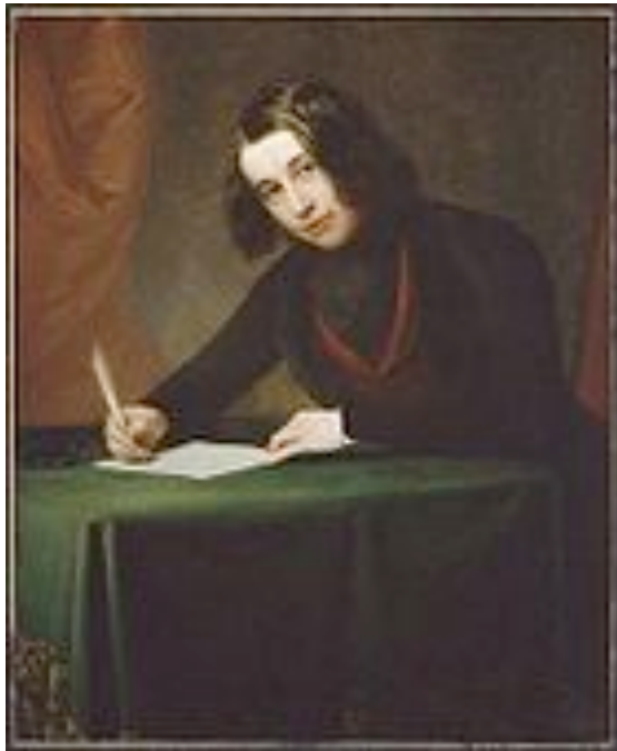
Dickens in 1842