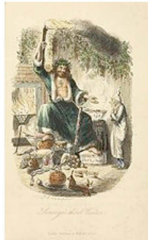
The Ghost of Christmas Present helped Scrooge learn the importance of charity.

Something significant to Dickens was the thought of charity . It is defined as "good will or love for humankind," and is something Scrooge learns by the end of the play.